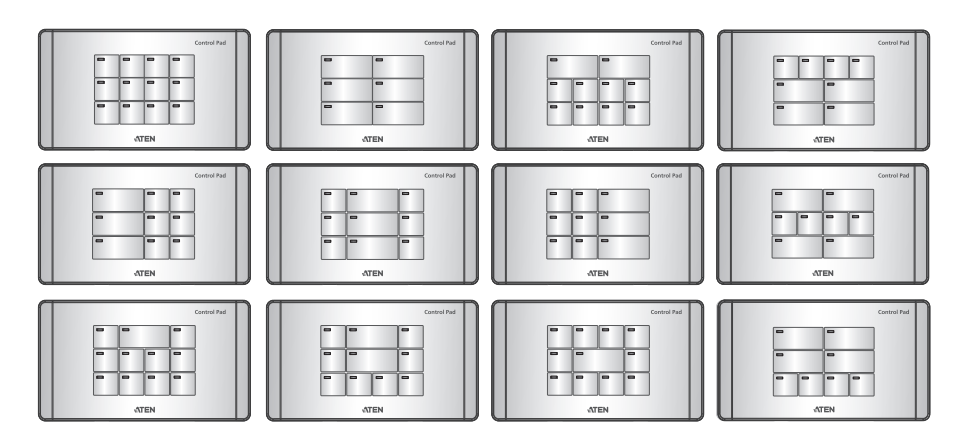
Custom button placement on the Control Pad can be set in 125 different combinations of 6 to 12 buttons. The example above shows the 12 most commonly used.