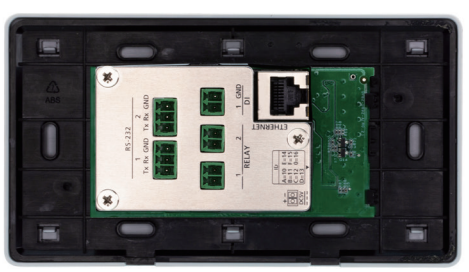
VK0200 Rear view